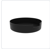
TR989361-BK- UNV-010 Black